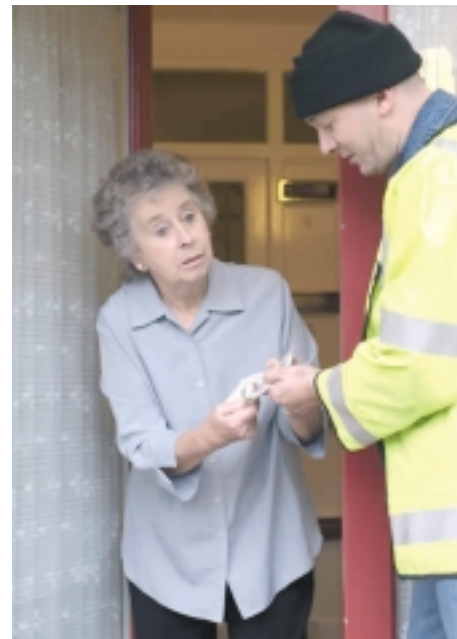
Take note of any strangers calling on elderly neighbours, and ask what the visit was about

Favourite ploys used by doorstep sellers include domestic appliance repairs, security equipment salesmen, and people claiming to be recently released from prison, selling dusters and similar household goods. This latter being a recent ploy - imagine